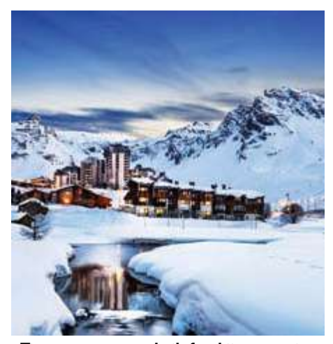
Tignes was purpose-built for skiing, meaning that the slopes are right on your doorstep.

The skiing is excellent. Over 200 miles of runs for every level mean that all but the most novice skiers can enjoy the stunning